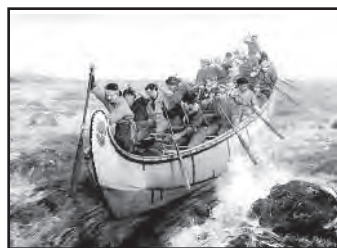
VOYAGEURS ~ CIRCA 1750